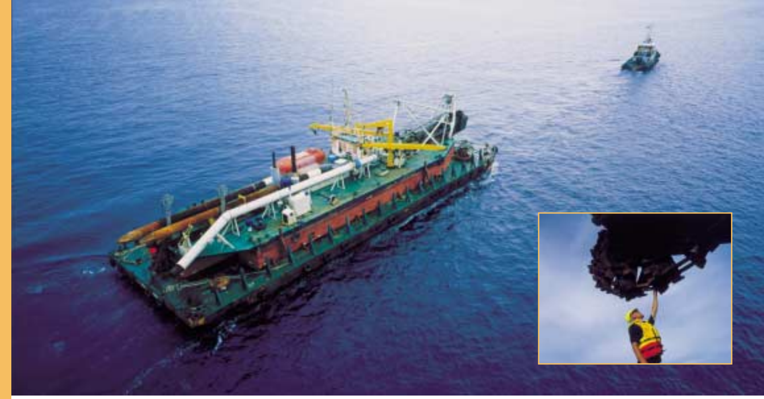
Dredge under tow from Singapore.

Unaudited profit before income tax for the half year rose from $0.153m for the same period last year to $1.89m. This was an extremely satisfactory result, as more traditional levels of work returned to offshore oil and gas areas, increasing turnover from $8.86m to $11.25m. The Company can also report an even better order book for the current six months, which will underpin a solid profit and cash outcome for the full year.